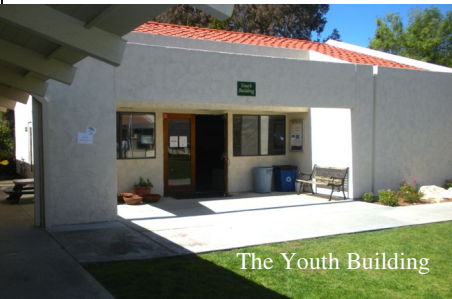
The Youth Building

JYF is for grades six to eight and meets weekly on most Sundays at various times. It provides a great place to build fellowship with youth who have committed to making the church an important part of their social circle, to participate in fun activities, explore issues that they face in a complicated world and participate in community service projects. A weekend retreat is held in August.