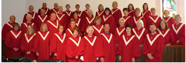
Chancel Choir and Covenant Ringers