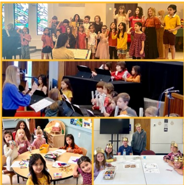
Children’s choirs & Sunday School classes