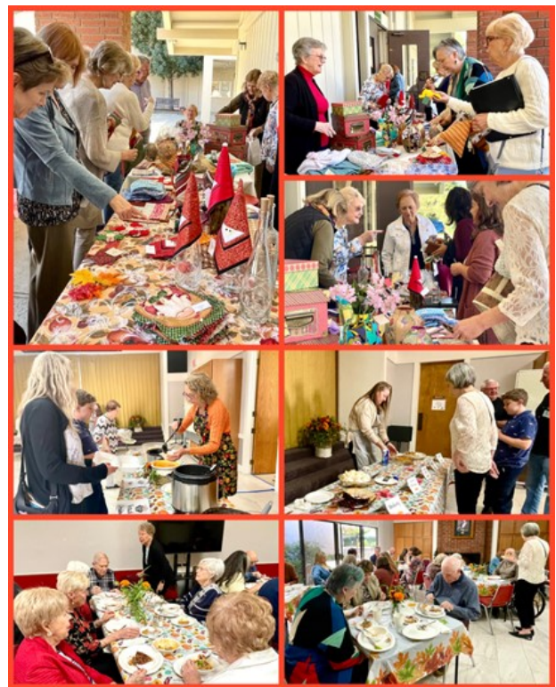
Crafty Ladies’ Sale and Soup & Pie Luncheon

November 10 was a busy Sunday, especially following worship. The Crafty Ladies were set up under the Alton Hall eaves to sell Fall and holiday décor and gifts that they have been busy making during the past few months. Inside Alton Hall, Women’s Ministry had its annual Soup & Pie Luncheon , always a delicious treat with several varieties of soups and pies available from which to choose. Also, the Missions Committee had the kick-off of its “Share the Joy” Christmas Gift Market on the patio. It will be available each Sunday until Christmas.