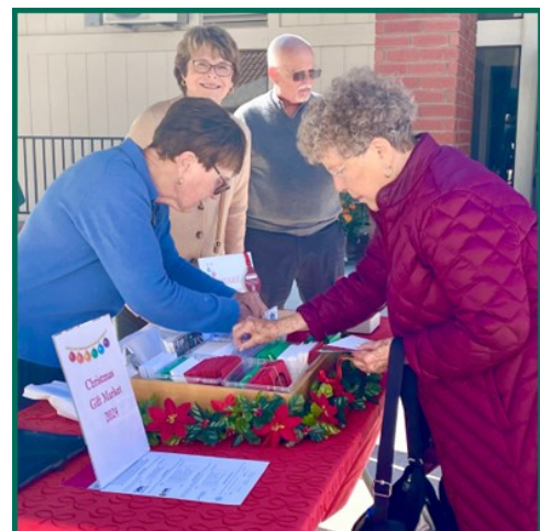
Christmas Gift Market table on the patio