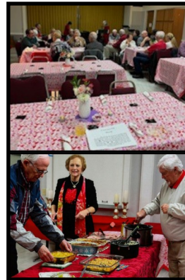
Saturday night Suppers in Alton Hall

Grands Who Read is a program at the Growing Place preschool where members of the church participate in story time in the classroom by reading to the children. You can bring a book you would like to read or the teacher can provide the book. The program is a half hour commitment once a month.