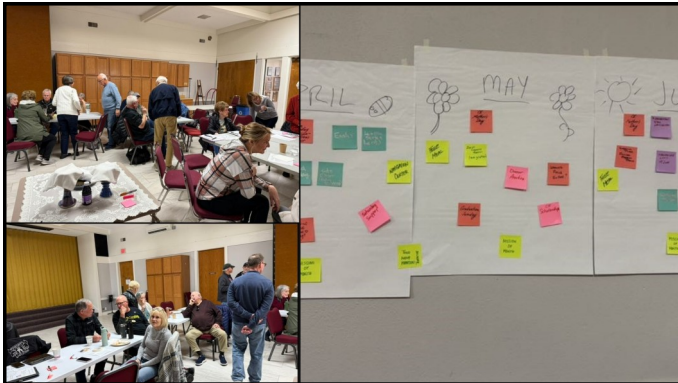
Ministry summit Feb 8 in Alton Hall