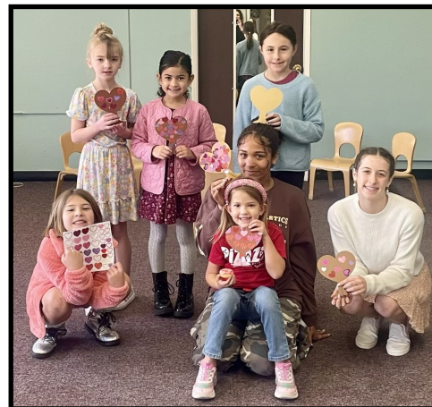
Sunday School made crafts for Valentines Day