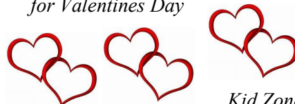
Kid Zone and Children's Time